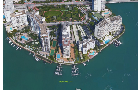
Built in 1972 - 274 units - 22 floors

Costa Brava Condominium Address: 11 Island Ave, Miami Beach, FL 33139 Phone: +1 305-532-6397