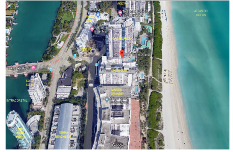
Built in 1982 - 112 units - 23 floors

Le Trianon Condominium Association Inc 6061 Collins Avenue Apartment 22c Miami Beach, FL 33140 Phone: (305) 861-9574