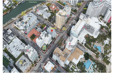
Built in 1941 - 32 units - 4 floors