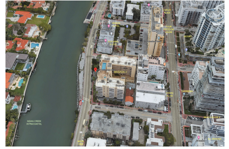
Built in 1999 - 59 units - 7 floors

Masada II Condo Corporation Address: 3737 Indian Creek Dr, Miami Beach, FL 33140 Phone: +1 305-534-1515