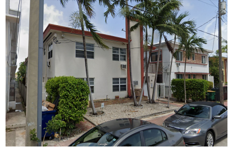
Built in in 1945/1958 - 158 units in total - 2 floors

Mimo On the Beach Condo Associates Address: 305 69th St, Miami Beach, FL 33141 Phone: +1 305-866-0902