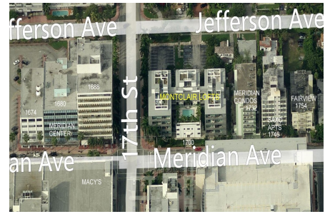
Built in 2005 - 41 units - 6 floors