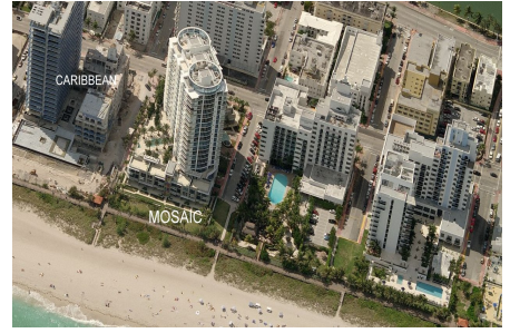
Built in 2006 - 90 units - 20 floors

Mosaic On Miami Beach Condo Association 305-674-8889