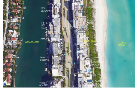
Built in 1968 - 347 units - 17 floors

Pavilion Condominium Association 5601 Collins Ave # 10, Miami Beach, FL 33140 (305) 861-2303 (305) 861-4600 (786) 543-2959 PavilionMiamiBeach@gmail.com http://www.pavilionmiamibeach.com/