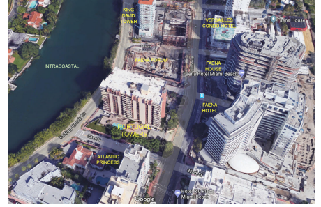
Built in 1982 - 95 units - 12 floors

Portugal Tower Condominium Address: 3200 Collins Ave, Miami Beach, FL 33140 Phone: +1 305-673-6259