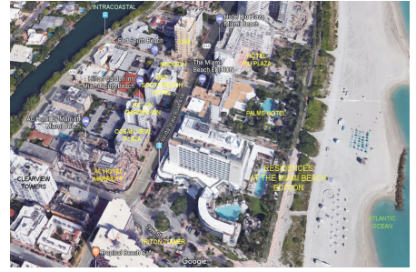
Built in 2014 - 24 units - 18 floors