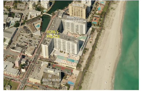
Built in 1926 - 564 units - 16 floors

Roney Palace Condo Association (305) 538-9395