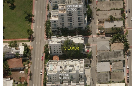
Built in 2004 - 10 units - 5 floors