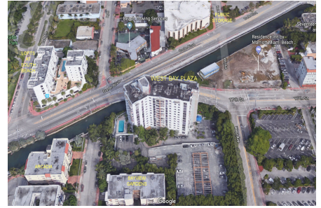
Built in 1995 - 112 units - 13 floors

West Bay Plaza Condominium Association Inc 1688 West Avenue # 807 Miami Beach, FL 33139 Phone: (305) 534-0017 (305) 534-0099