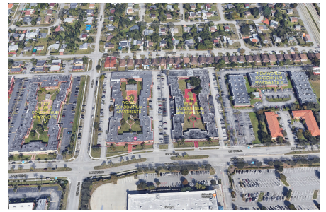
Built in 1969 - 84 units - 2 floors

New World Condominium III Address: 271 NW 177th St, Miami, FL 33169 Phone: +1 305-999-9700