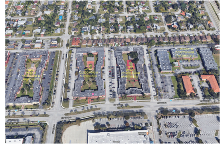
Built in 1971 - 126 units - 2 floors

New World Condominium III Address: 271 NW 177th St, Miami, FL 33169 Phone: +1 305-999-9700