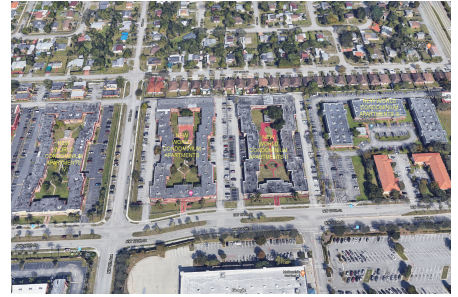
Built in 1970 - 90 units - 2 floors

New World Condominium III Address: 271 NW 177th St, Miami, FL 33169 Phone: +1 305-999-9700