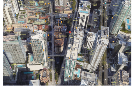
Built in 2019 - 525 units - 64 floors

Brickell Flatiron 1000 Brickell Plz, Miami, FL 33131 https://websites.vertilinc.com/flatiron