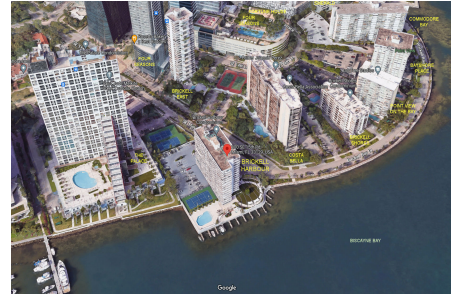
Built in 1974 - 159 units - 17 floors

Brickell Harbour Condominium (305) 854-6144