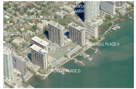
Built in 1975 - 293 units (939 in total with A, C & D) - 26 floors

Brickell Place Condominium Association Phase I Inc (305) 854-5343