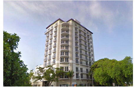
Built in 2009 - 51 units - 11 floors

Brickell Way Condominium Association Inc (305) 250-4195