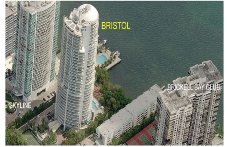
Built in 1993 - 146 units - 39 floors

Bristol Tower Condominium Association (305) 856-2200 & (305) 856-7670