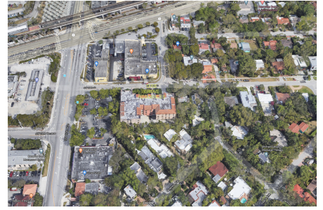
Built in 2004 - 62 units - 4 floors