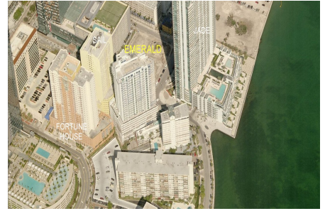
Built in 2006 - 142 units - 27 floors

Emerald at Brickell Condo Association 305.416.6065