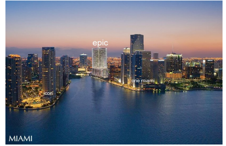
Built in 2008 - 342 units - 54 floors