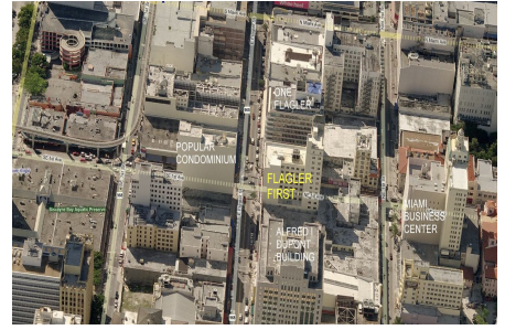
Built in 2008 - 91 units - 10 floors

Flagler First Condominiums Inc (305) 579-0029