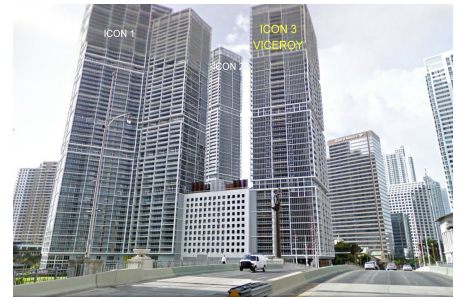
Built in 2010 - 520 units - 48 floors