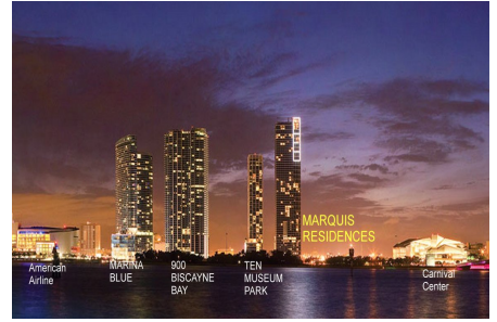
Built in 2009 - 306 units - 67 floors

Marquis Residences 1100 Biscayne Blvd, Miami, FL 33132 (305) 571-4000