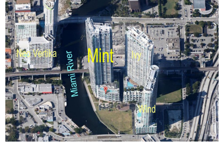
Built in 2010 - 531 units - 53 floors

Mint Condo Association 92 SW 3rd St, Miami, FL 33130 (305) 961-1620