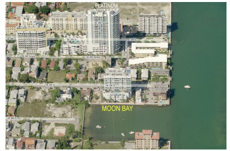
Built in 2007 - 61 units - 12 floors

Moon Bay of Miami Condo Association (305) 571-0390