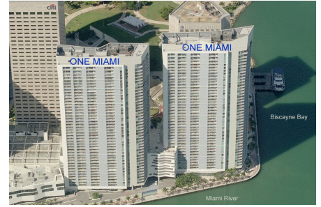
Built in 2005 - 896 units - 44 floors

One Miami Master Association (786) 425-1515