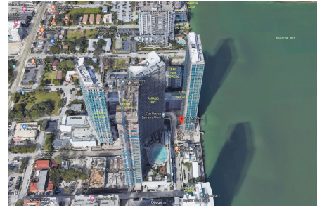
Built in 2018 - 273 units - 54 floors

One Paraiso Residences Address: 3131 NE 7th Ave, Miami, FL 33137 Phone: +1 305-390-0416