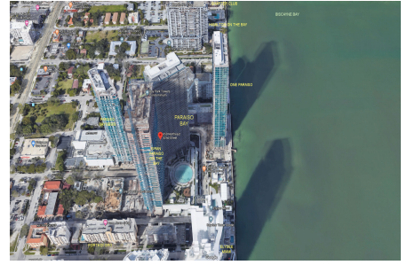
Built in 2018 - 364 units - 53 floors

Paraiso Bay Residences Address: 650 NE 32nd St, Miami, FL 33137 Phone: +1 305-390-0416 https://www.paraisobaycondomiami.com/index.htm