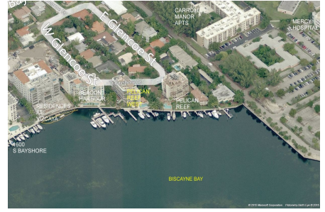
Built in 1984 - 14 units - 6 floors

Pelican Reef Condominium Associates Address 1632 S Bayshore Ct Miami, FL 33133-4030 Phone Number 305-858-2141