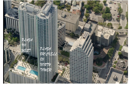
Built in 2008 - 560 units - 56 floors

Plaza on Brickell Condo Association Tower I 786-220-5959