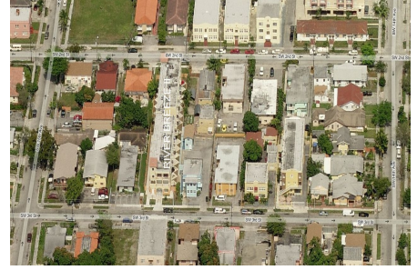
Built in 2007 - 16 units - 3 floors