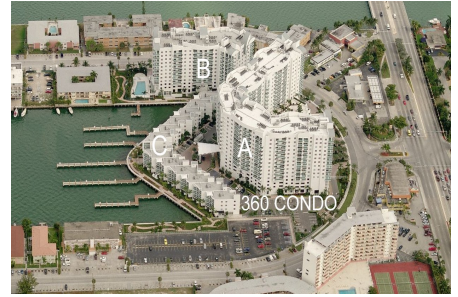
Built in 2007 - 279 units (414 with buildings B & C) - 15 floors

360 Condominium Association (786) 378-5860