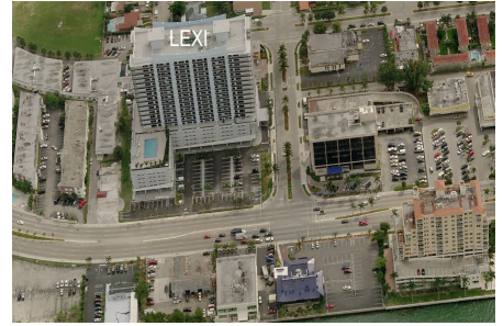
Built in 2007 - 164 units - 19 floors