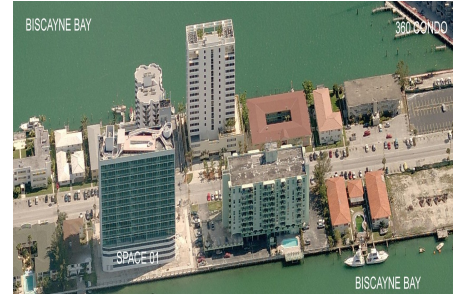
Built in 2006 - 54 units - 15 floors

Space01 Condominium Association (305) 754-7738 & (305) 754-9793