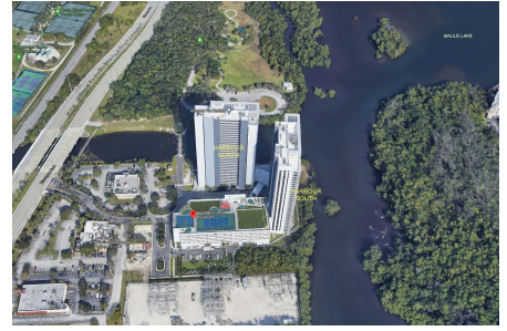
Built in 2018 - 425 units - 33 floors