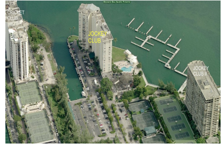
Built in 1968 - 167 units - 22 floors

Jockey Club Maintenance Association Inc 11111 Biscayne Boulevard Miami, FL 33181 Phone: (305) 891-2728