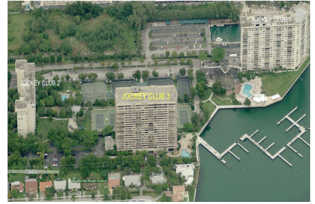
Built in 1982 - 148 units - 22 floors

Jockey Club Maintenance Association Inc 11111 Biscayne Blvd, Miami, FL 33181 (305) 891-2728