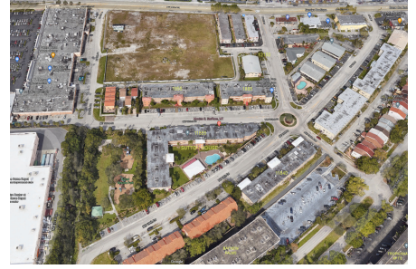
Built in 1963 - 149 units - 3 floors

Sutton House Apartments Address: 11855 NE 19th Dr, North Miami, FL 33181, Phone: +1 305-891-0553