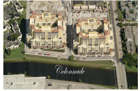
Built in 2007 - 148 units - 10 floors

Colonnade At Dadeland SE Condo (305) 663-5454