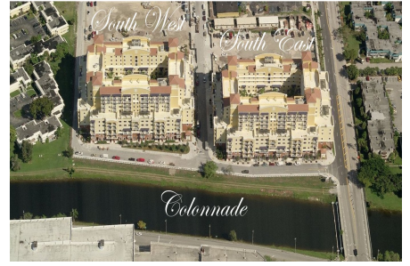
Built in 2008 - 150 units - 10 floors

Colonnade at Dadeland Condo Association Management Office 8390 Southwest 72nd Avenue Miami, FL 33143 (305) 663-5454