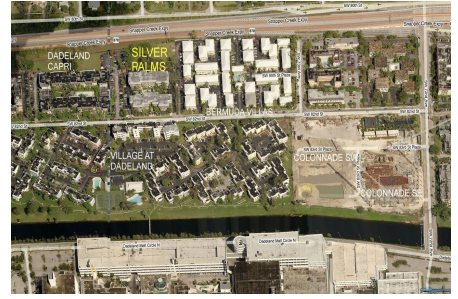
Built in 1968 - 69 units - 3 floors

Silver Palms Dadeland Condominium Association 305 669 2798 & (305) 667-1449