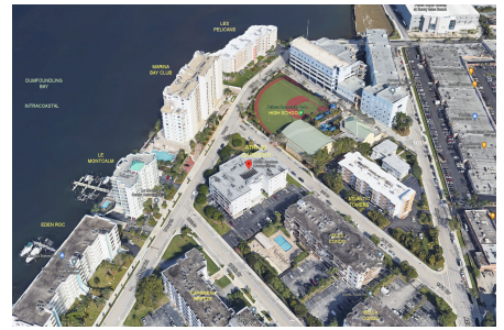
Built in 1981 - 36 units - 5 floors

Atrium Gardens Condo 18001 North Bay Road Sunny Isle Beach, FL 33160 (305) 935-5865