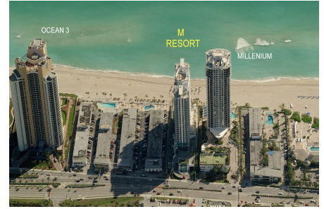
Built in 2005 - 210 units - 25 floors

Number of units: 210 Number of active listings for rent: 0 Number of active listings for sale: 7 Building inventory for sale: 3% Number of sales over the last 12 months: 9 Number of sales over the last 6 months: 5 Number of sales over the last 3 months: 1