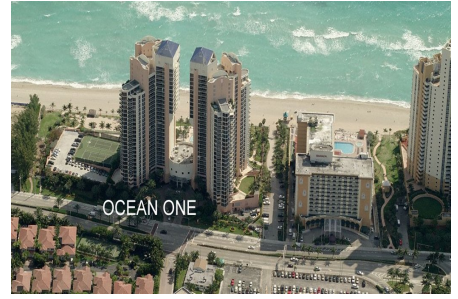
Built in 1999 - 241 units - 30 floors