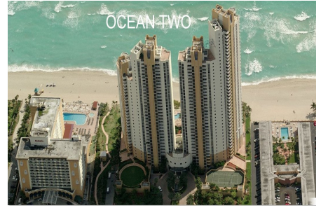
Built in 2001 - 253 units - 40 floors

Number of units: 253 Number of active listings for rent: 6 Number of active listings for sale: 5 Building inventory for sale: 1% Number of sales over the last 12 months: 10 Number of sales over the last 6 months: 5 Number of sales over the last 3 months: 1