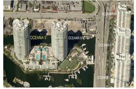
Built in 2002 - 157 units - 29 floors

Oceania V A Condominium Association (305) 944-7700